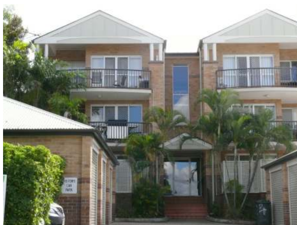
Stafford Unit Block