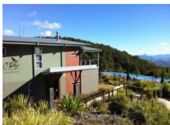
O'Reilly's Day Spa & Conference Centre

That's more than just the way we treat our customers, but also in the way we respect their property. Pride in the job we do and pride in the people we work with. Take pride in your place and ADP will treat it as if it was our own.