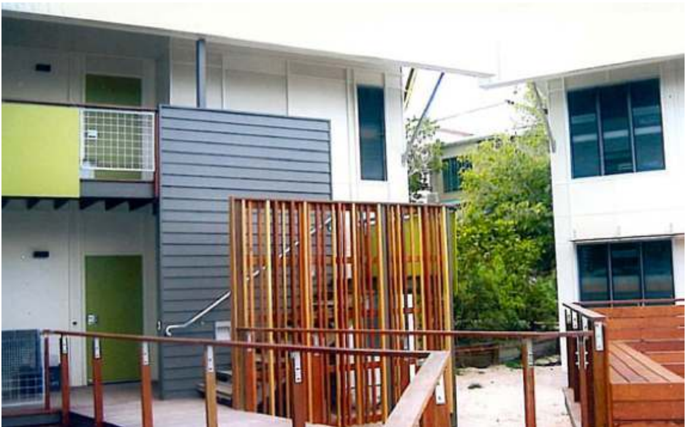
Heron Island Research Station and Accommodation