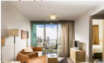
Mantra South Bank